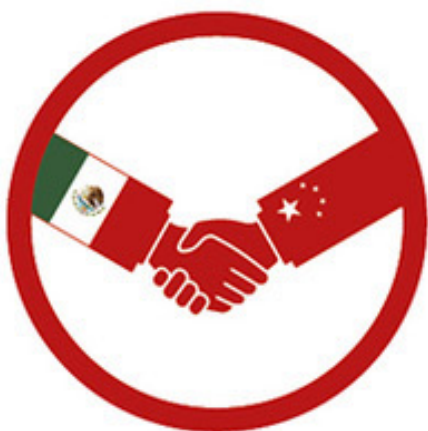
Mexico import data (USD billions)